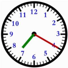
What Time Is It ?