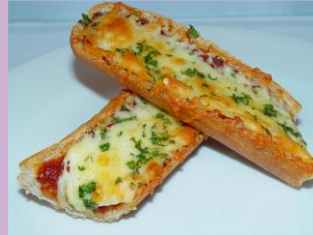
French Bread Cheese and Tomato Pizza with Wedges