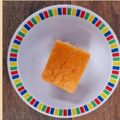
Summer Lemon Cake