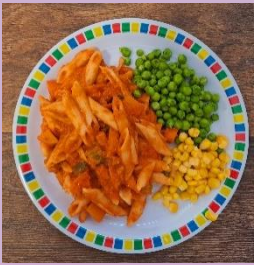
Tomato and Lentil Pasta