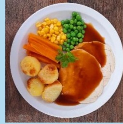
Roast Chicken with Roast Potatoes and Gravy