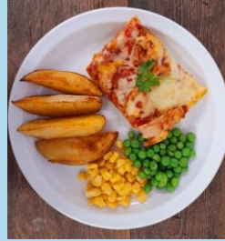
BBQ Chicken Pizza with Wedges