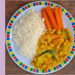
NEW Chickpea Curry with Rice