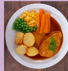
Roasted Quorn with Stuffing, Roast Potatoes and Gravy